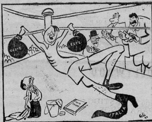
LA PRIMERA VUELTA.