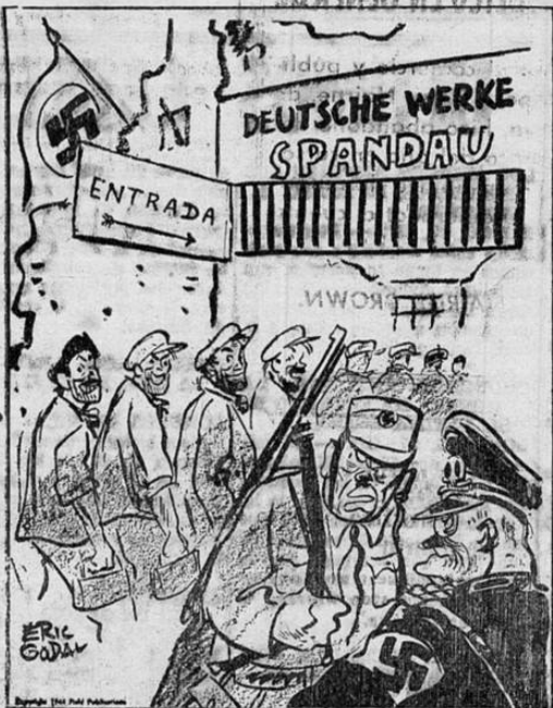
"¿No habría manera de prohibir a los obreros extranjeros que se sonrieran en estos días...?"

Se administra untando la parte afectada de la úbre inflamada, con un algodón trazo empapado con linimento, varias veces al día. Se ordenará a fondo y preservará la res del fr